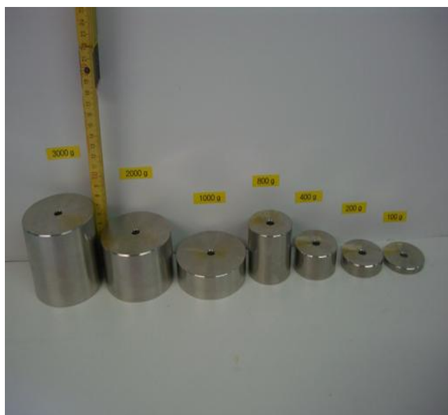
Figure 2: Used weights provided by the kjVI.